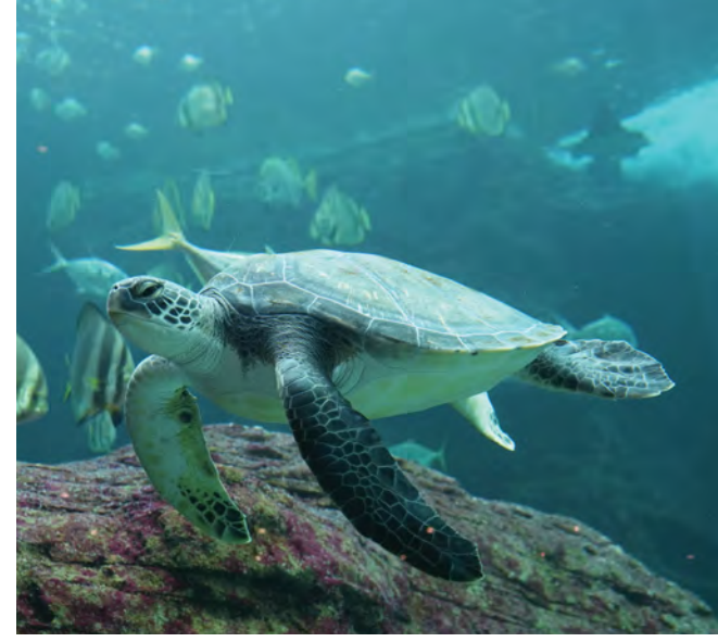
Nori, the green turtle at the Two Oceans Aquarium Foundation

tracking tag and we have watched Bheni's journey with fascination. From De Hoop's protected waters to the depths of the Vema Trench and the coral reefs near the Seychelles, Bheni's voyage paints a vivid picture of the interconnectedness of marine life. By October 2024, Bheni had travelled an amazing 14 500km at a speed of around 50kms per day and was documented 200km off Somalia's coastline! What a testament to the incredible