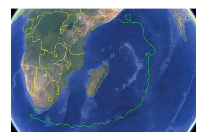
Morukuru Goodwill Foundation sponsored a satellite tag so the Turtle Conservation Centre could keep a watchful eye over Bheni.

Bheni arrived at the Two Oceans Aquarium Foundation's Turtle Conservation Centre for rehabilitation a few years back with a significant infection under his scutes (shell plates). With love, patience, and constant care, he made a miraculous recovery. His fighting spirit earned him a special place in the hearts of the Centre's turtle heroes... and the hearts of many of our supporters! Once he was well enough to return to the ocean, Bheni was released at De Hoop Nature Reserve in December 2023 by the Two Oceans Aquarium Foundation's Turtle Conservation Centre. Guests of Moruku Family De Hoop were able to witness this incredible moment. Morukuru Goodwill Foundation sponsored a satellite